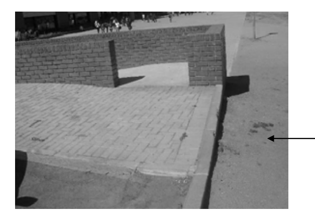
Figure 4: Ramps with no dropped kerb, no handrails, and no shade

No dropped kerb for smooth transfer at the end of the ramp