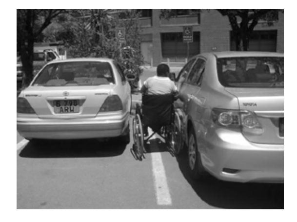
Figure 23: Marked but not accessible parking lots

Twenty eight percent (28%) of the assessed buildings did not have parking lots close by. For those with reserved and clearly marked disability parking lots (43%), they were not accessible to wheelchair users because they were standard size, and did not allow for the transfer into or out of the car with or without assistance (Figures 23 and 24). From the main gates, there are no signs for easy identification and access to designated accessible parking bays. Only one parking space had signs to direct wheel chair users and shade to protect them from rain and the sun during transfer. For most parking lots, the wheelchair user would have to endure rain and heat during transfer into and out of the car.