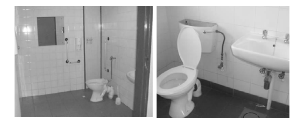
Figure 13: Accessible toilets but high accessories

Toilets were found to be generally available at different floor levels. Only eight buildings had toilets reserved for people with special needs. However, only four of those had space to transfer from the wheelchair to the toilet. Seven buildings had washbasins with knee space and taps reachable from a seated position. The toilets had grab bars but some items and accessories such as light switches, mirrors, toilet paper holders, soap dispensers, and hand dryers were too high (Figure 13).