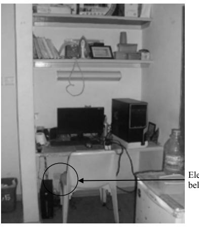
Figure 17: Accessible study table and high book shelves

the wheelchair outside and the door open, and this compromised their privacy. With no wheelchair, Lesego struggled to access the bathtub that had no rails to hold on to. Only one hostel had grab bars in the bathtub. Wash basins in 4 hostels and taps in 5 hostels were reachable from a sitting position.