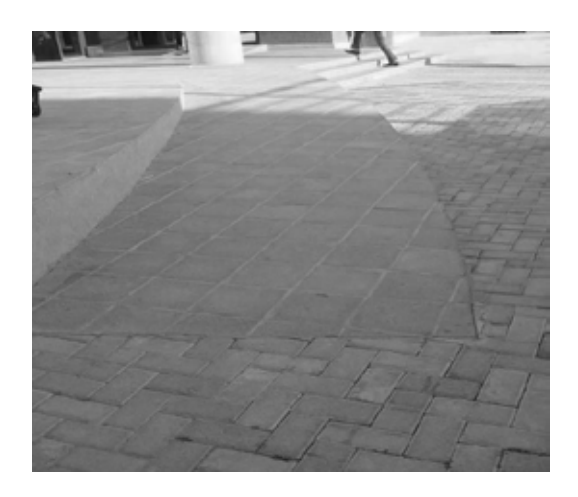
Figure 2: Good gradient shaded ramps with handrails and nonslippery flooring – Administration building