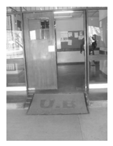
Figure 8: A well maintained and not so well maintained dropped kerb