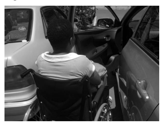
Figure 24: No space to transfer from or into the car