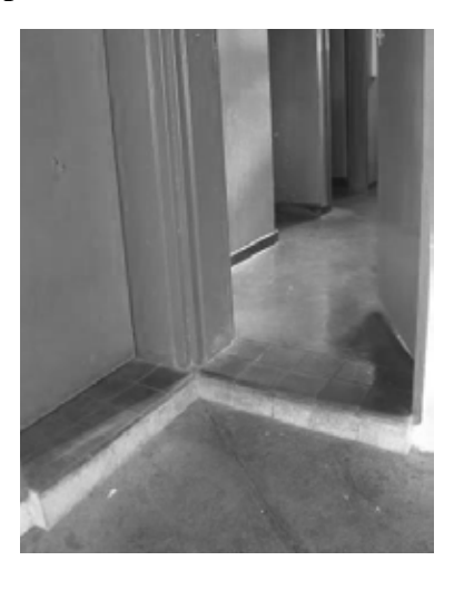
Figure 15: An access hindering gate at Block 480