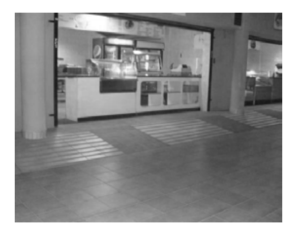
Figure 11: High counters at cashier's office