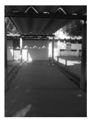
Figure 19: Unshaded pathway to the hostels