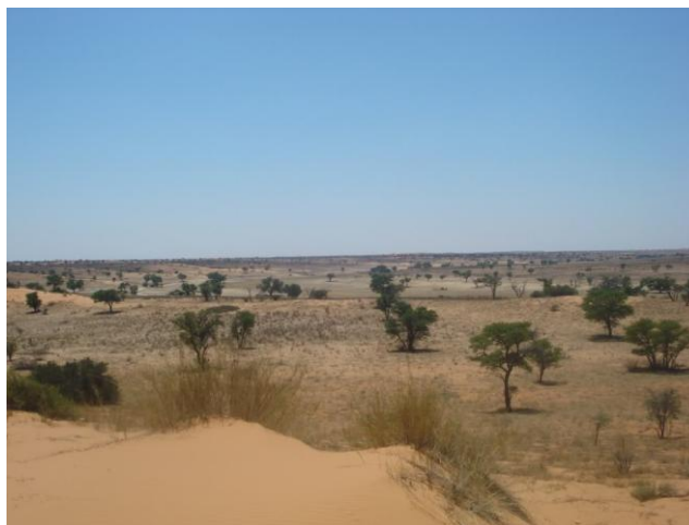
Figure 6. Kgalagadi Desert

Kgala means 'dry' in Setswana. The adjective is intensified by -gadi , which literally means 'female', giving a meaning that probably refers to a great expanse of dry land. The Kgalagadi desert of Botswana is rich in natural resources and these include the grassland that feeds its wildlife and cattle, thus supporting the country's 3rd largest industry-cattle ranching and its mineral wealth namely diamonds which have fostered and sustained dramatic economic growth. Its vegetation includes savannah types, namely grass, shrub and tree savannah (cf. Botswana Tourism, 2013c). The Khutse Game Reserve, the Central Kalahari Game Reserve and the Kgalagadi Transfrontier Park are located here. These Game Reserves accommodate a larger variety of African wildlife, including the rarest wildlife species of the world (cf. Wikipedia, 2013a).