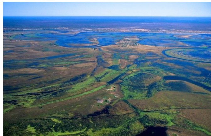
Figure 4. Okavango Delta

The name “Okavango”, we understand, is a name borrowed from Cubango in Angola which is a name of a river. The Okavango Delta is situated deep within the Kalahari Basin and is also referred to as the ‘jewel’ of the Kalahari. The Okavango River travels from the Angolan highlands and crosses into Botswana at Molembo. It is reported that the Okavango Delta is home to 122 species of mammals, 71 species of fish, 444 species of birds, 64 species of reptiles and 1300 species of flowering plants (Botswana Tourism, 2013b).