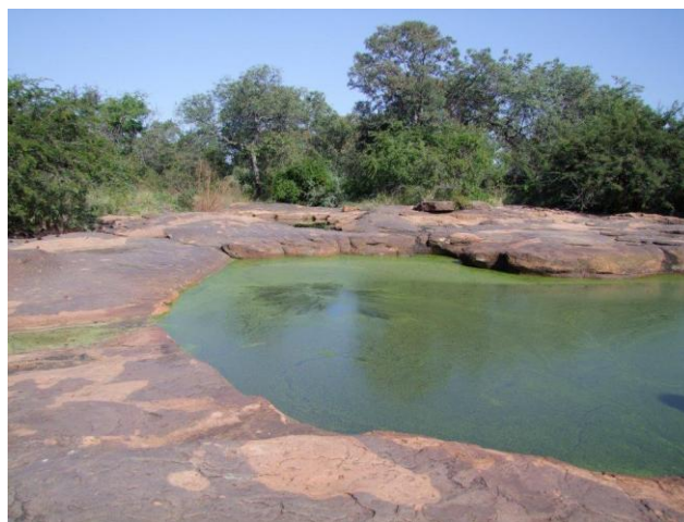
Figure 1. Matsieng Footprints

According to the Matsieng Legend, Matsieng, the first man, is believed to be the ancestor of the Tswana people. The Tswana people believe that life began when he emerged from a hole in the ground followed by his people and animals. At that time, the rocks were soft and wet and as such the footprints were left on the rocks. Matsieng engravings, situated at Rasesa village, display mostly animal tracks and human footprints. “Rock engravings are the main attraction to this site. In addition to the engravings, there are two large holes at Matsieng and these retain water for a long time depending on the rainfall conditions. The site is associated with the creation myth that attempts to explain cosmology” (Government of Botswana, 2011a).