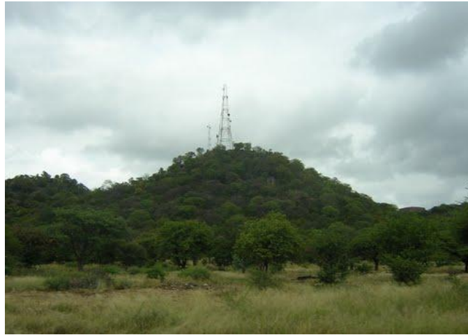
Figure 10. Nyangabwe Hill (Wikimapia n.d.)