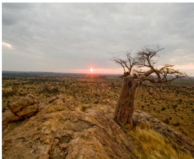
Figure 7. Makgadikgadi Pans