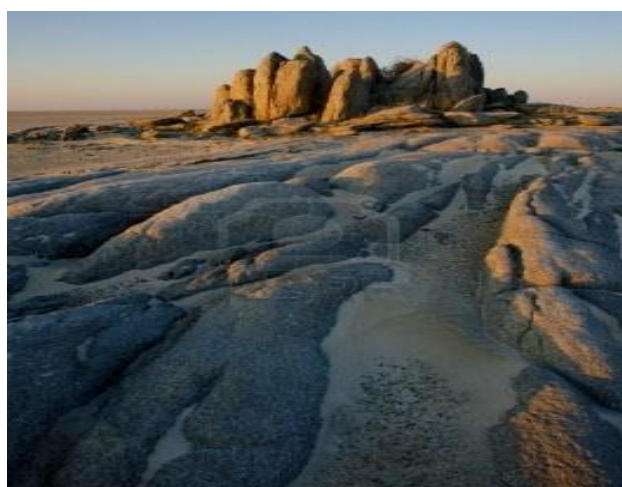
Figure 9. Lekhubu Island (us.123f. nd.)

This tourist site is reputed to be the wonder of the Makgadikgadi Pans. It is situated along the shoreline of the Sua Pan, off the main track between Gweta, Nata and Letlhakane. Its unique location attracted humans from time immemorial. Ancient Ruins found here are recorded as the Lost City of the Kalahari by early travellers who were impressed by this magnificent island (Botswana Tourism Board, 2012, Site 8). The residents of Sua, Nata, Letlhakane, Gweta and other nearby settlements visit the site to ask God for rain and to make offerings. Traditional taboos governing the use of the island prohibits removal of rocks, fruits and hunting of animals (Government of Botswana, 2011c).