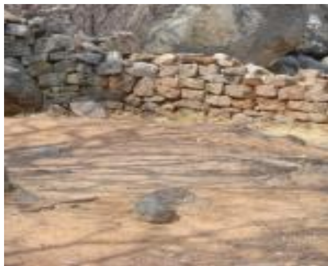
Figure 8. Domboshaba Ruins (Batatu Safari Botswana n.d.)

Domboshaba Ruins was built during the Great Zimbabwe period around 1400 AD. The first reported excavations in Botswana were undertaken here in 1929. Chinese celadon porcelain, glass beads and clay birds were found here (Botswana Tourism Board, n.d.; see also Botswana Tourism Board, 2009, p. 23). Domboshaba Ruins, consisting of dry stone walls, are located in Vukwi village in the North east of Botswana. The first part of the site is on a hilltop and the second part is on a valley (cf. The Tourism Spotlight, 2013). It is believed that the chief of the Kalanga people lived on the hilltop with some of his assistants. Domboshaba is a sacred site for local communities and there are annual ceremonies conducted at the site (see also Government of Botswana, 2011b). The most popular event is the one held every 30th September or 1st October when the Kalanga people promote their culture and language.