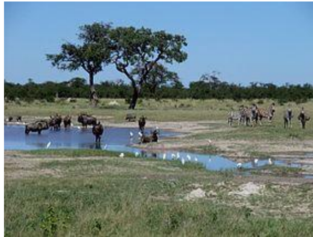
Figure 3. Chobe National Park (Wikipedia n.d.)