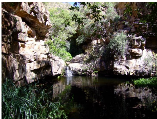
Figure 2. Moremi Gorge