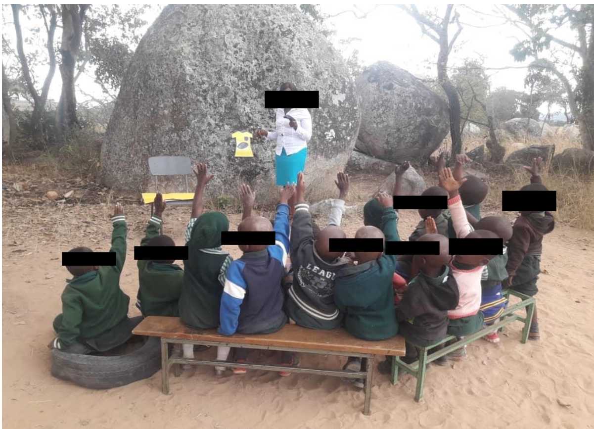
Plate A: Learners at a Reading Camp being taught phonic sounds