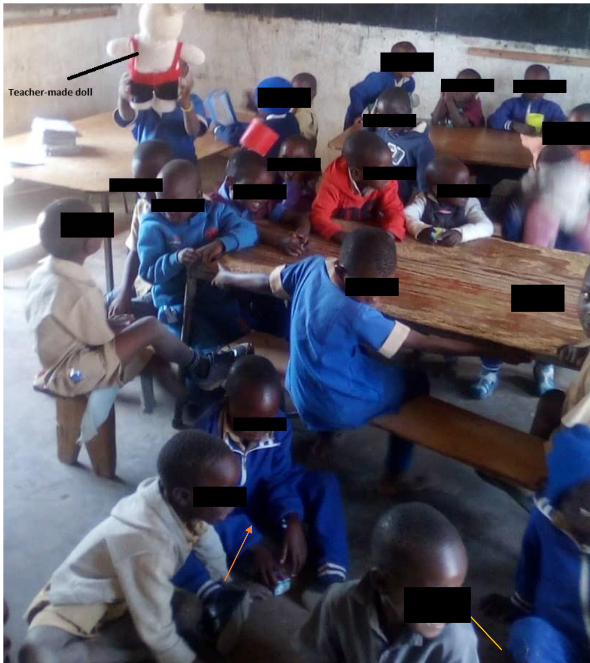
Plate B: EC learners apparently hiding from being asked to manipulate an electric doll

afraid of the battery powered doll probably because they had grown up hearing about the dangers of electricity.