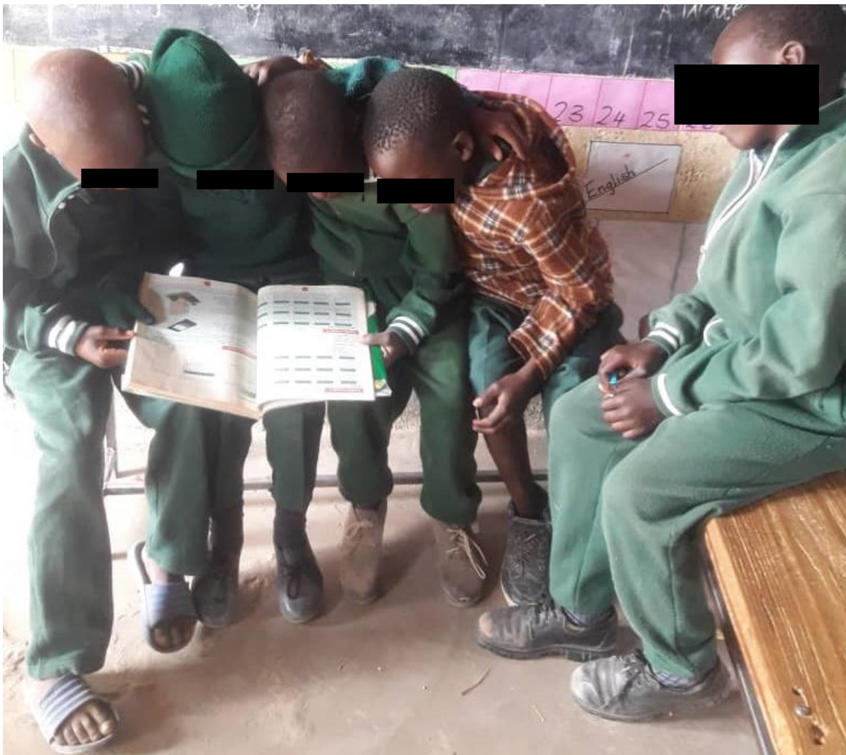
Plate C: Learners chorusing sounds in unison from a textbook which they share